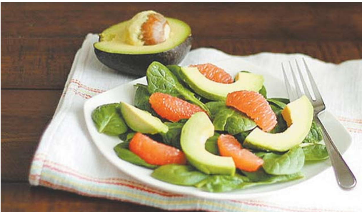
Avocado and grapefruit salad with a sweet ginger dressing. Go go avocado!

New Gastroposter who looks at beautifully photographed food for cooking inspiration