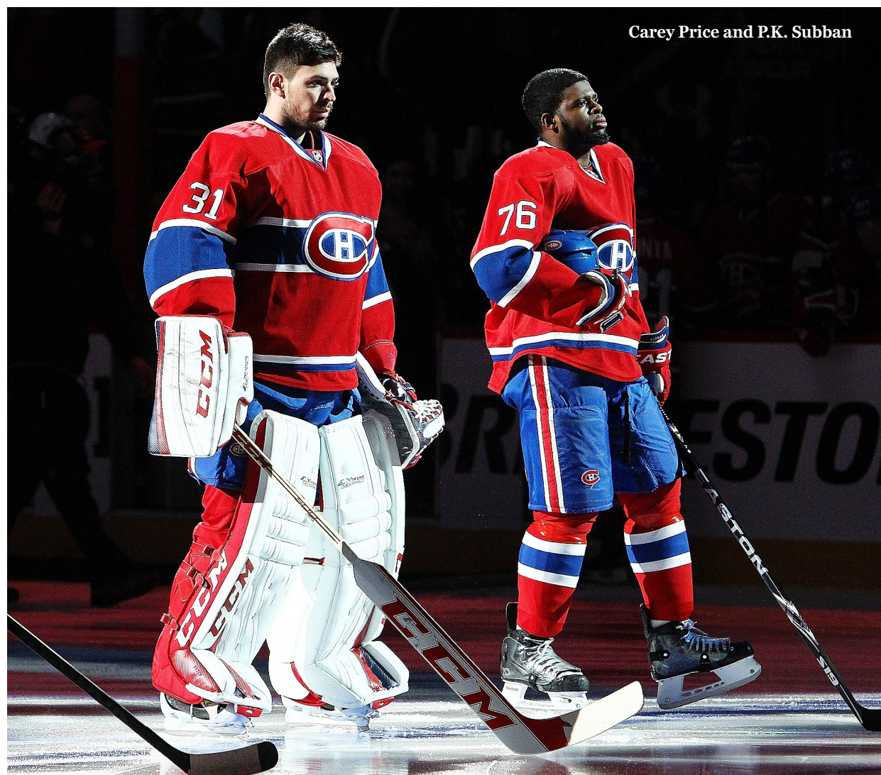
Carey Price and P.K. Subban