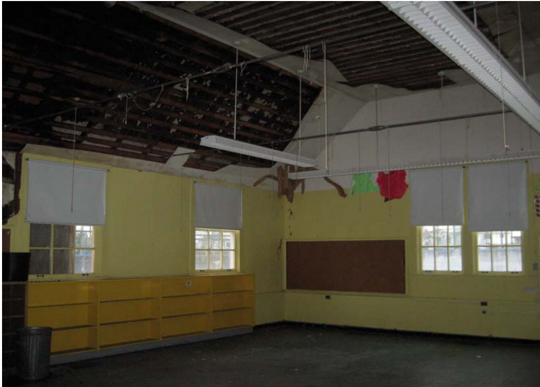
INTERIOR OF BUILDING C – FIRE DAMAGED CEILING STRUCTURE