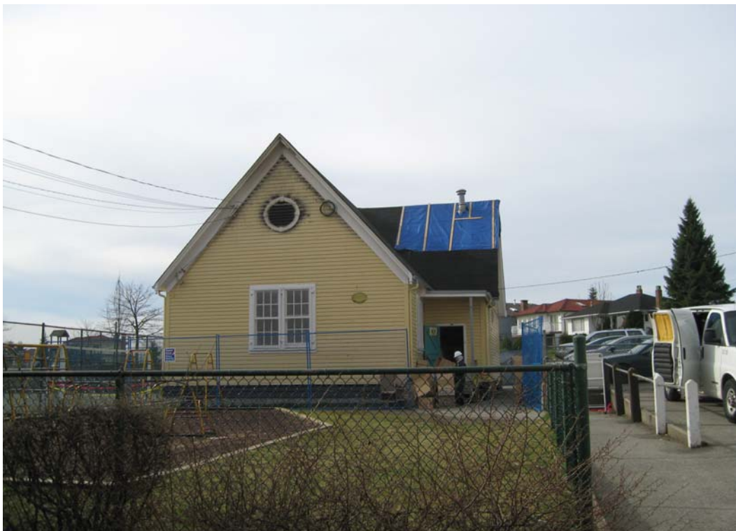
EXTERIOR OF BUILDING C – FIRE DAMAGED ROOF STRUCTURE

On March 2 nd , 2008 an arsonist set fire to a wood frame out-building (Building C) at Sir Guy Carleton Elementary. This two-classroom building, constructed in 1896, has a total area of 229 m 2 (2,465 sq.ft). Unfortunately, the fire damage was so extensive that continued occupancy was not permitted until significant interior restoration, structural upgrades and roofing work is completed. Due to immediate health & safety concerns, asbestos exposed by the fire was removed in April, 2008.