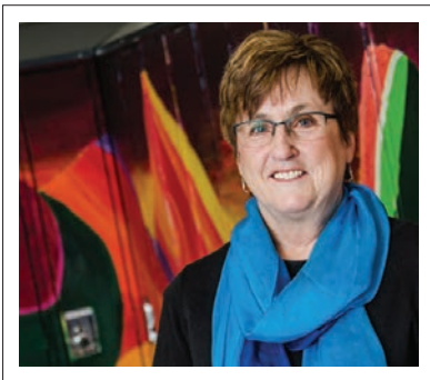
➤ IN PROFILE 10