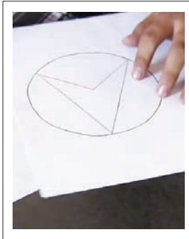
➤ EXPLORE 12