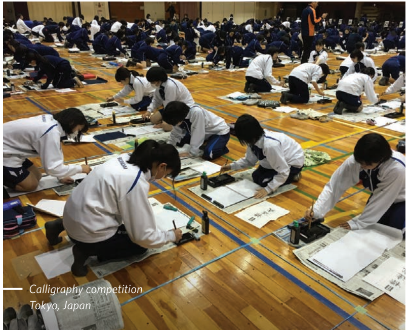
Calligraphy competition Tokyo, Japan