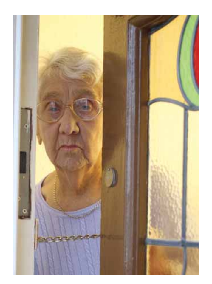
This is the reality behind the dry term 'social exclusion' - feeling detached from society; trapped at home; cut-off from services; lonely and isolated; struggling to cope. Just imagine.

You hear a knock at the door. Fear and panic race right through you. Of course, it's probably just a neighbour or one of their children asking to be sponsored. But what it's a conman or a thief? You feel terribly at risk from anyone who might come to the door. As you go to your kitchen to hide from the sound, you're thinking, 'there is no-one to look after me, if something happened to me who would notice?'