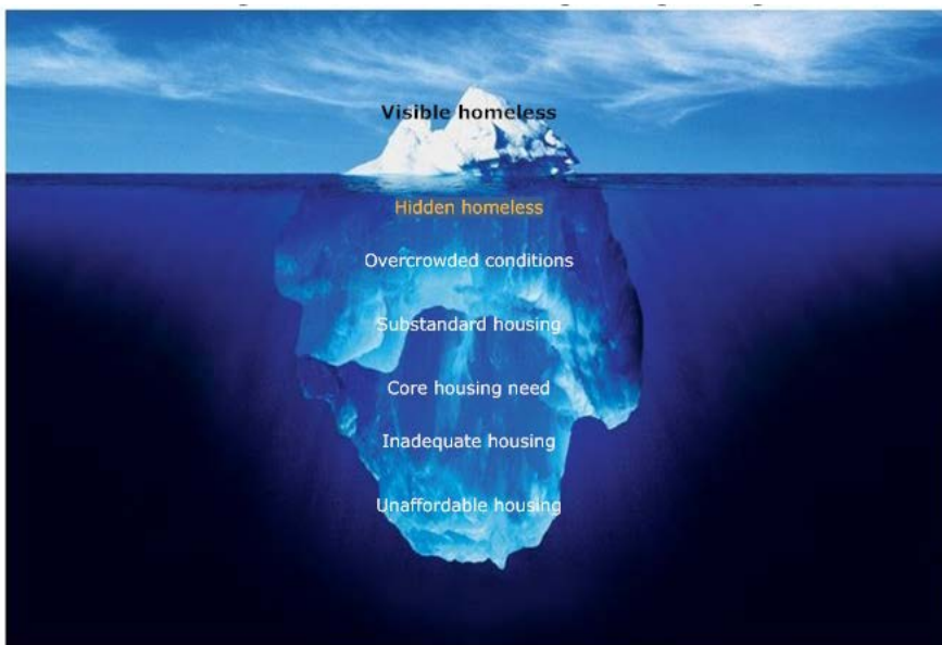
Figure 1: Precarious Housing Iceberg Paradigm

Based on 2006 census data, about 56,000 Metro Vancouver households are in core housing need 10 and spending at least 50% of their income on shelter and are considered to be at risk of homelessness. 11